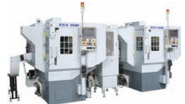
▶ FS4 Series - High Output CNC Lathes