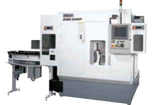
▶ ANS Series - Single Spindle CNC Lathes