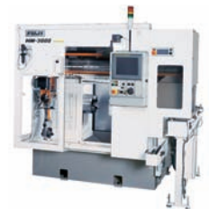
▶ HM Series - 5 Face Machining Milling Cell