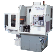
▶ VN Series - Vertical CNC Lathes