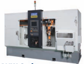
▶ ANW Series - Dual Spindle CNC Lathes

For more information, visit www.fujimachine.com Phone (847) 821-2432